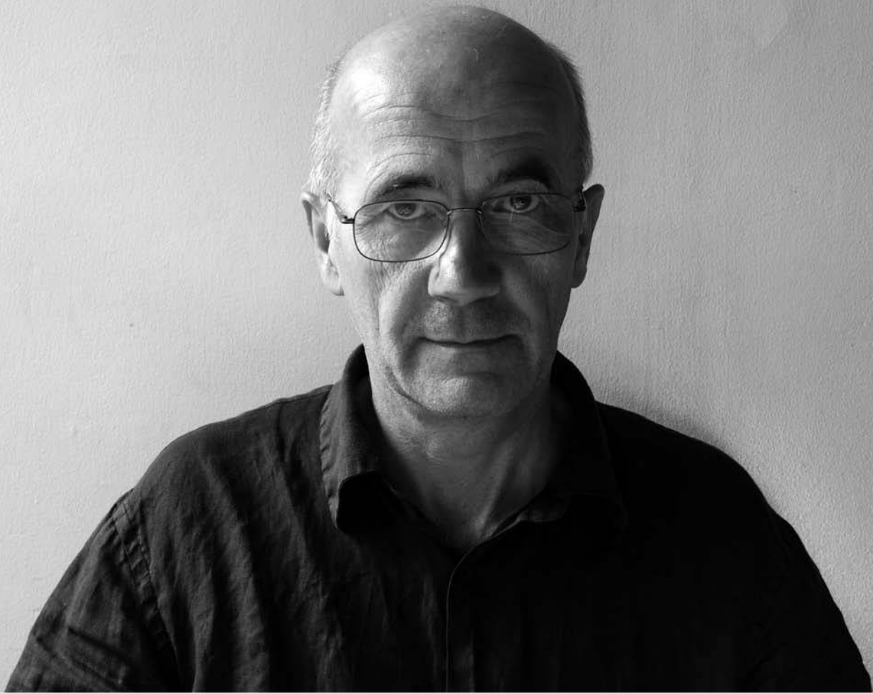
Patrick Keiller

In one of the single most brilliant shots, a spider is filmed meticulously spinning out its web while the narrator lists a series of recently failed banks, pointing to the utter fragility of a system built out of cobwebs and spun by those determined to structure the world in their own image, however delicate that world turns out to be. But the countryside has hidden strengths of its own: the narrator attempts to understand Robinson's interest in biophilia, symbiosis, and mutualism. In these marginal theories, nature is understood to work by cooperation (and we should not exclude machines from the possibility of coexistence—shots in which a tractor or combine harvester are seen in Robinson in Ruins are images of calm and productivity not exploitation). The revolutionary history of the British countryside—the Captain Swing riots, the fights against the enclosure acts, and the general rambunctiousness of the British peasantry of centuries past—are all remembered here with great and burning reverence. Robinson in Ruins may well be a document that explicitly takes its cue from a rather gloomy statement by Fredric Jameson in “The Antinomies of Postmodernity,” collected in The Cultural Turn (Verso, 1998), “that it seems