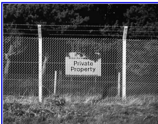
Left column: London . © 1994 British Film Institute. DVD: BFI (U.K.). Right column: Robinson in Space . © 1997 BBC. DVD: BFI (U.K.).